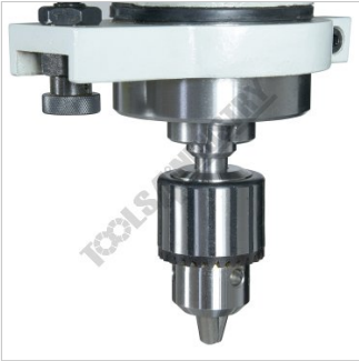
Includes Drill Chuck