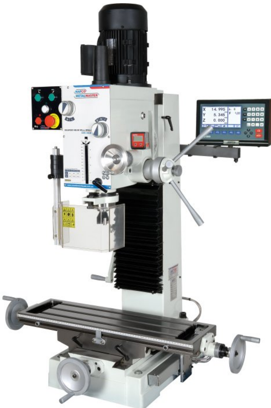
Table Travel: (X) - 485mm (Y) - 175mm (Z) - 430mm

Mill Drill - Geared & Tilting Head - 415V