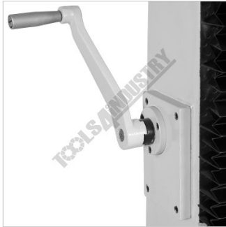
Rack And Pinion Wind Up Head