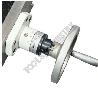
Table Longitudinal Handle