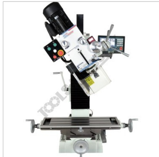
Tilt Head Right