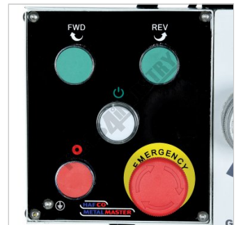
Forward Reverse ON OFF and Emergency Switches