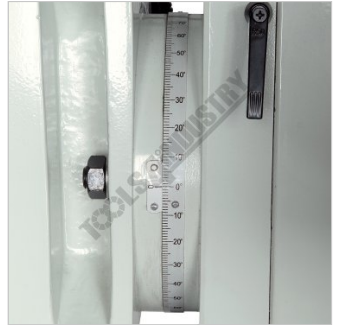
Tilting Head Scale