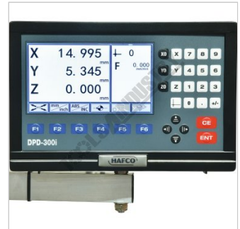
3 Axis Digital Readout Counter Fitted with 2 Axis X-Y Scales Only