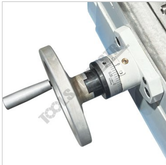
Table Cross Feed Handle