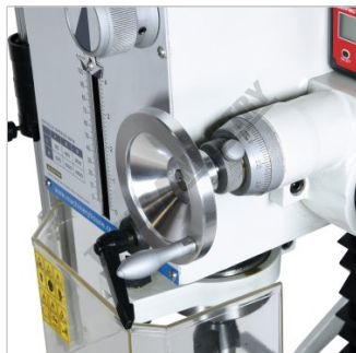
Fine Quill Feed Handwheel