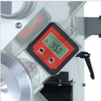
Digital Tilting Head Gauge