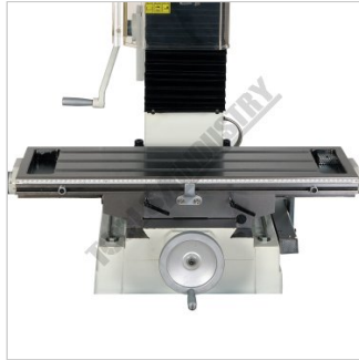
Ground Work Table with T Slots