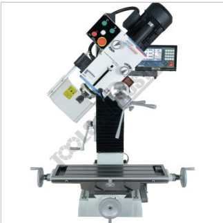
Tilt Head Left