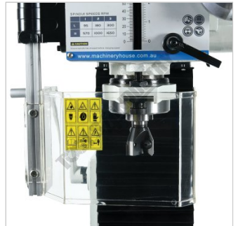
Interlocked Spindle Safety Guard