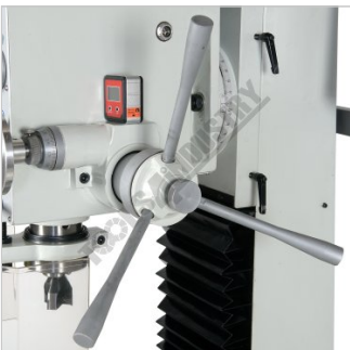
Quill Feed Lever