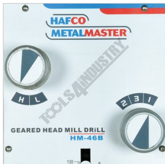
Spindle Speed Selectors