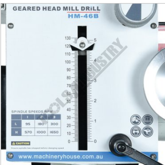
Quill Depth Stop Scale- Spindle Lock