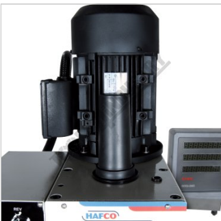
Drawbar and Motor