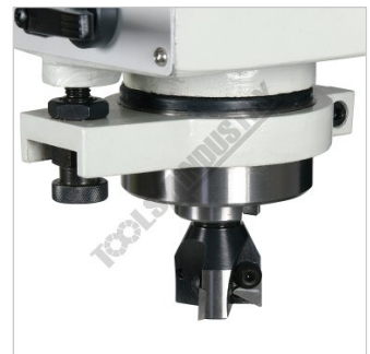
Includes Face Mill Cutter