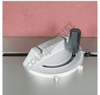
Mitre Guide Scale