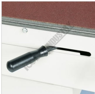
Quick Action Belt Tension Lever