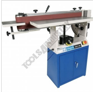
Adjustable Table Height