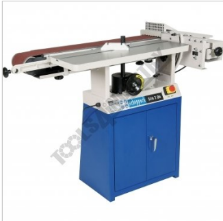
Horizontal Sanding Belt Position