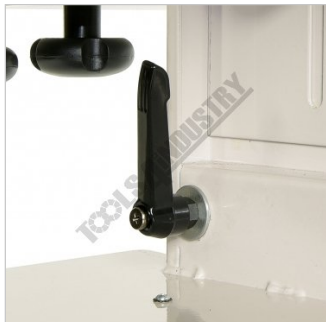
Belt Angle Tilt Lever Lock