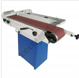
Table Guide Support