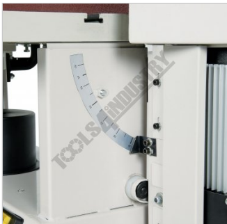
Tilting Table Scale