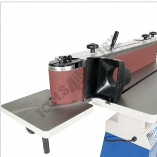
Dust Port for End Table