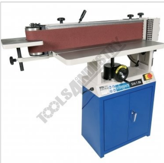
Table Height Lowest Position