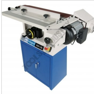
Table Guide Support Rear View