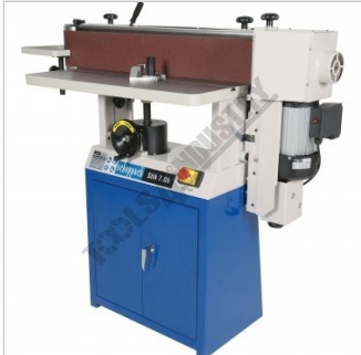
Right Rear View