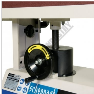
Table Height Adjustment Handle