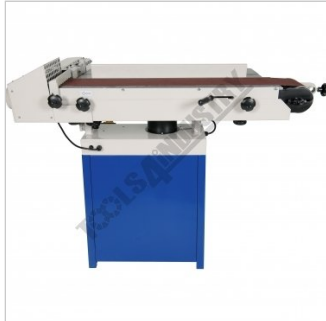
Side View of Belt