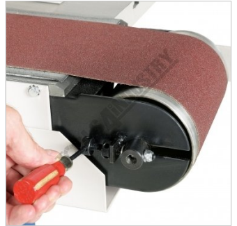
Belt Tracking Adjustment