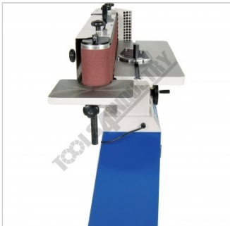
End Table View