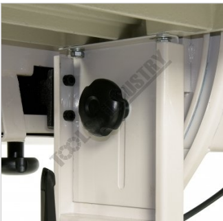
Table Height Locking Knob