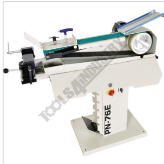
Quick Change Belt System