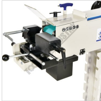
Quick Action Compound Vice