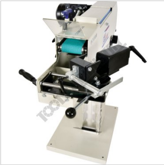
Swivel Vice From 30 90