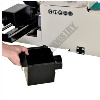
Removable Front Dust Tray