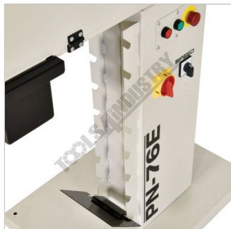
Rack For Roller Storage