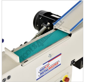
Top Station For Flat Linishing Deburring