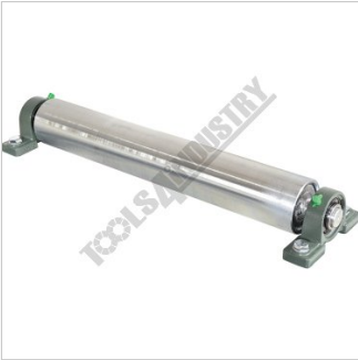
450mm Heavy Duty Ball Bearing Rollers with Grease Nipples