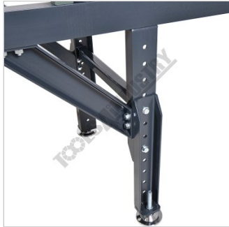
Adjustable Legs and Feet