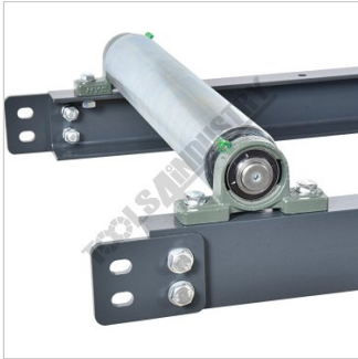
Extendable Attachment Plates