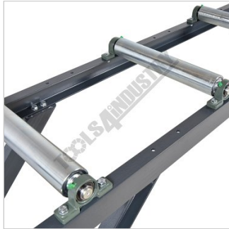
Additional Drill Holes For Extra Rollers