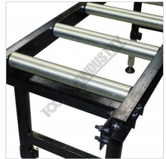
Heavy Duty Frame