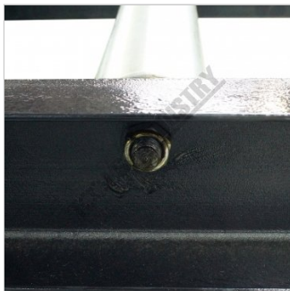
Heavy Duty Roller Axle