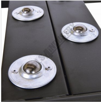
Steel Transfer Balls