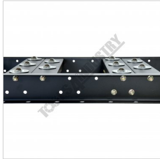
Adjustable Slide Positions