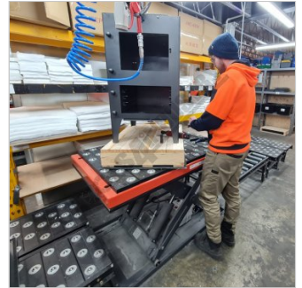
Assembly Line Use