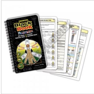
Shown with Pages