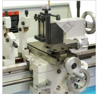
Shown fitted to Lathe