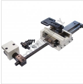
Rear View 2