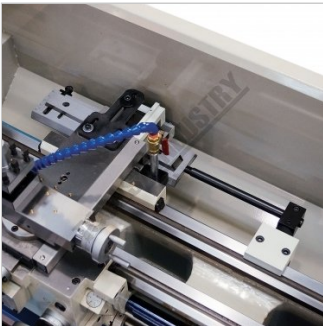
Shown Mounted to a Lathe