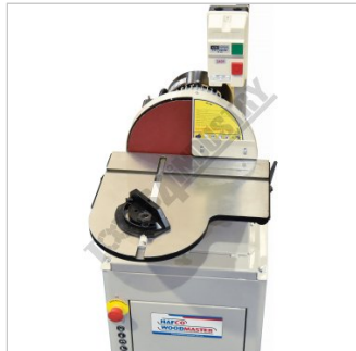
Top View Of Table