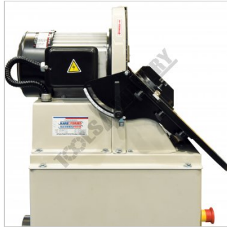
Table Tilted At 45 Degrees