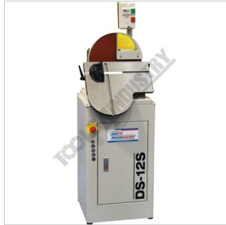
Table Shown Tilted