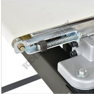
Belt Tension Adjustment