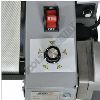
Variable Speed Dial