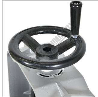
Handle For Height Adjustment