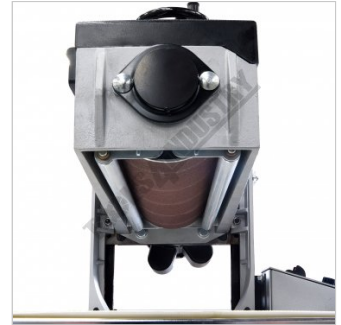
Sanding Wheel with Rollers