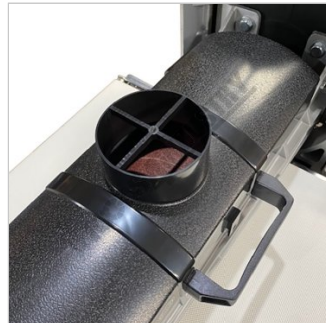
100mm Dust Outlet