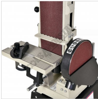
Table and Mitre Guide