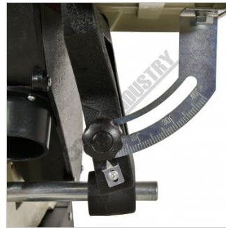
Table Angle Adjustment