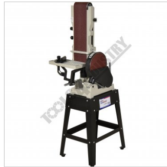
Vertical Linishing Position