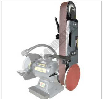
Vertical Position With Tool Rest Mitre Table