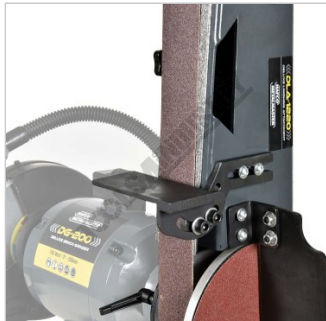
Vertical Position With Tool Rest