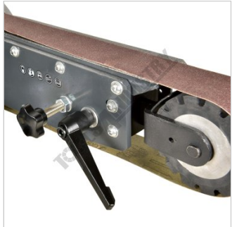
Belt Tensioner Adjustment