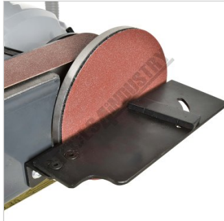
Adjustable Mitre Table