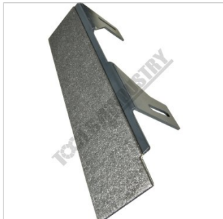
Includes Adjustable Lower Platen Table