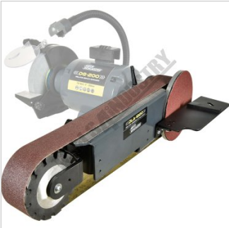
Shown Fitted On Optional Grinder G144