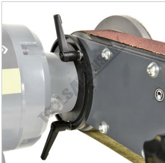
Tool-Less Angle Adjustment