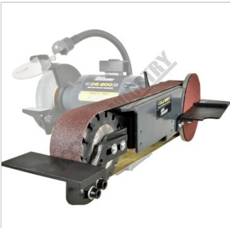
Included Adjustable Tool Rest