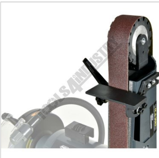
Vertical Position With Tool Rest Mitre Table