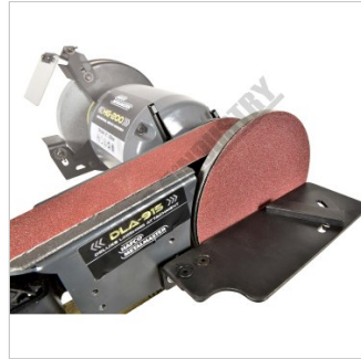
Adjustable Mitre Table