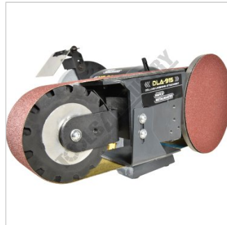
Includes Adjustable Platen Table