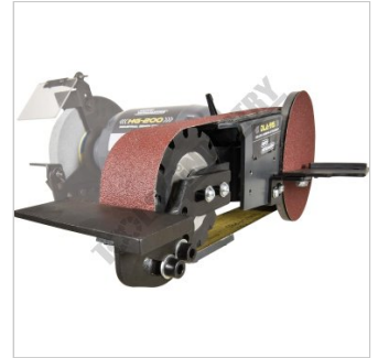
Includes Adjustable Tool Rest