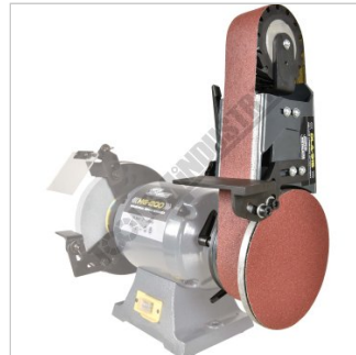
Vertical Position With Tool Rest