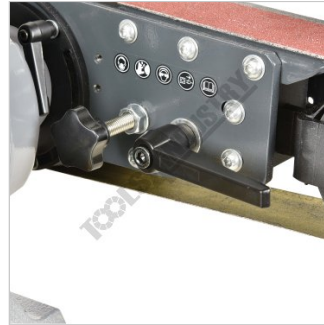
Belt Tensioner Adjustment