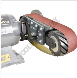
Quick Release Belt