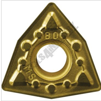
Tip Top View