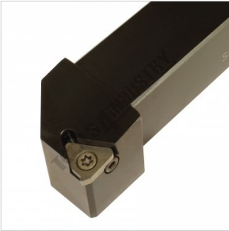
Toolholder Close Up