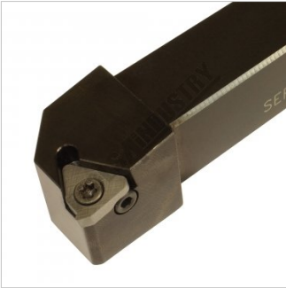
Toolholder Close Up