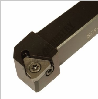
Toolholder Close Up