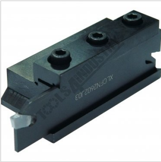
Shown Setup with Optional Blade and Tip