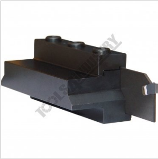
Shown Setup with Optional Blade and Tip