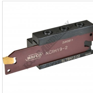
Set Up For Use