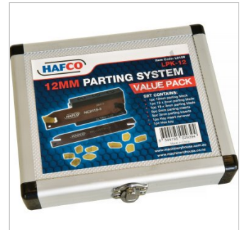
Aluminium storage case