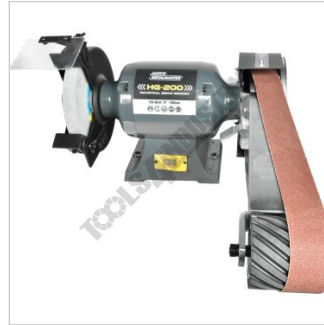
Large Work Surface-Quick Action Belt Change