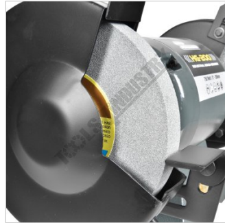
Fine Aluminium Oxide Grinding Wheel