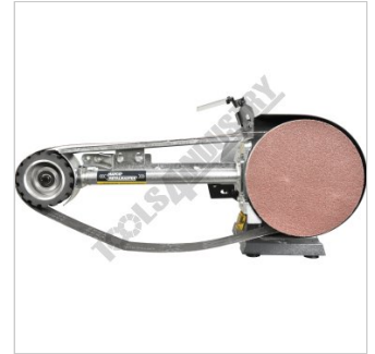
Adjustable Belt Tensioner