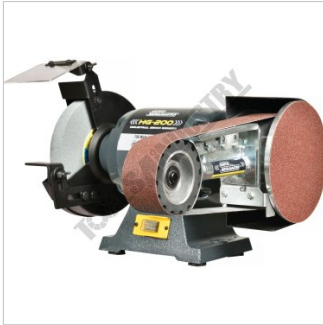
Fitted To Optional Bench Grinder G142