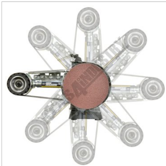
360 Degree Head Rotation