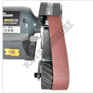
Large Working Surface- Quick Action Belt Change