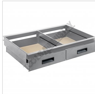
Shown with Drawers Closed