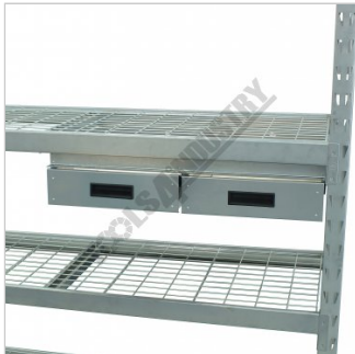
Shown Mounted to Racking with Drawers Closed