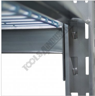
Internal Shelf Locking Wedge Type System