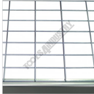
Shelf Wire Mesh