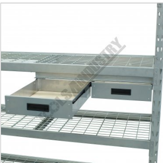
Shown Mounted to Racking with Drawer Open