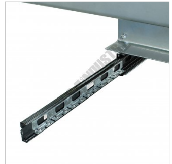
Ball Bearing Slides