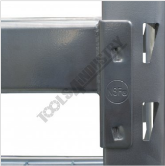
External Shelf Locking System