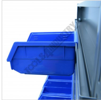
Optional Bucket Shown Clipped Onto Bracket