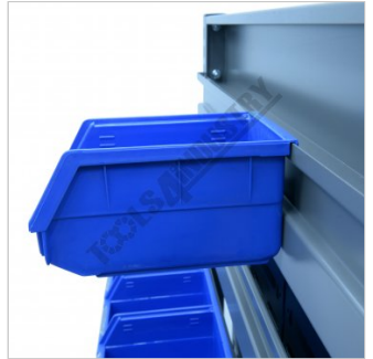
Optional Bucket Shown Clipped Onto Bracket