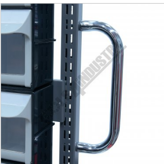
Chrome Handle Mounts on Left or Right Side