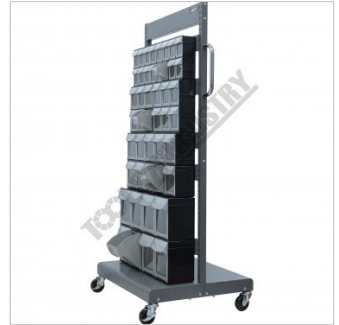
Right Side View Few Buckets Open