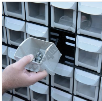
Removable Bins For Easy Access & Refilling