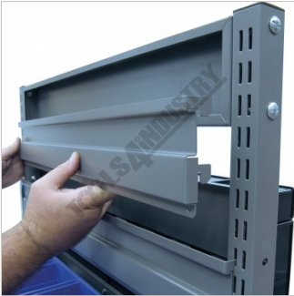
Optional Bracket Shown Clipping Onto Frame