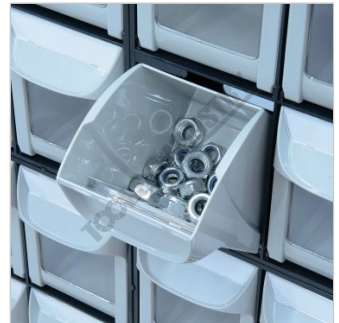
Bins Open Smoothly To a 40° Angle