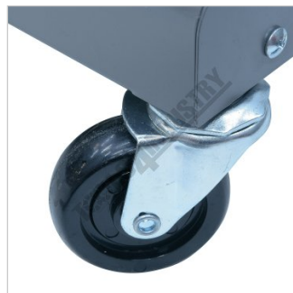
2 x Swivel Wheels