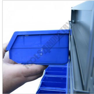
Optional Bucket Shown Clipped Onto Bracket