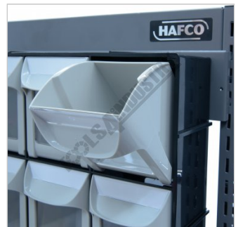
Bin Opened To 40° Angle