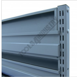
Optional Bracket Securely Clipped Onto Frame