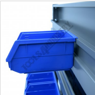
Optional Bucket Shown Clipped Onto Bracket