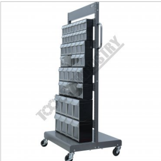
Right Side View Two Buckets Open