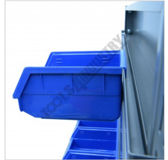
Optional Bucket Shown Clipped Onto Bracket