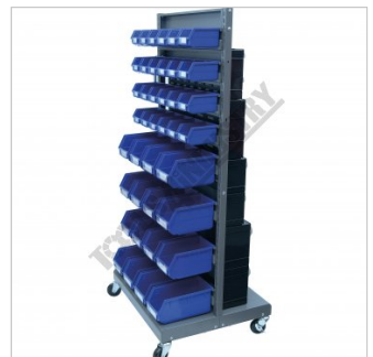
Shown with Optional Buckets A432, A434, A436