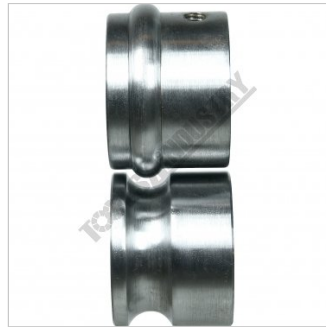
3.8 9.5mm Beading Dies