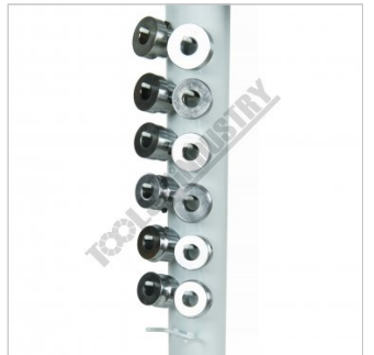
Rolls Stored on Stand