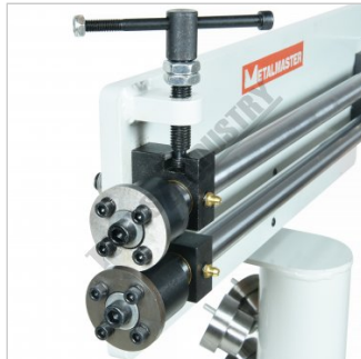
Top Roll Height Adjustment Handle