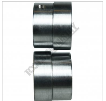
1.16 1.6mm Stepped Dies