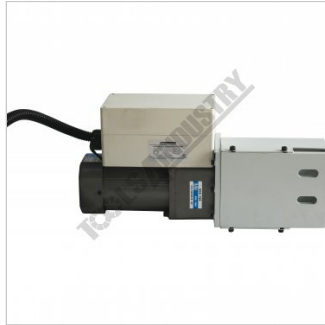
Variable Speed Drive Motor