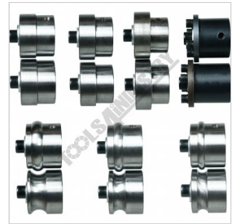
Side Profile View Of Die Sets