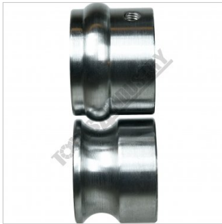
1.2 12.7mm Beading Dies