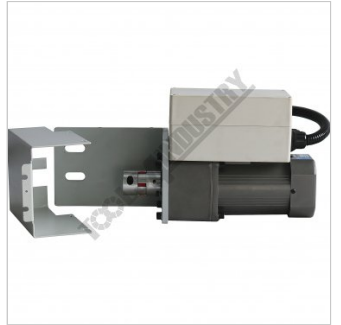
Drive Shaft Coupler Connector