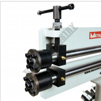
Shown With Shearing Dies