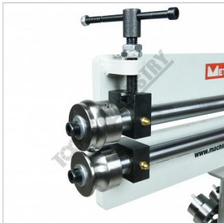
Shown With 1.2.12 Beading Dies