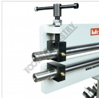
22mm Spigot for Mounting Rollers