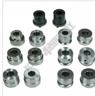
Includes 7 Sets of Dies