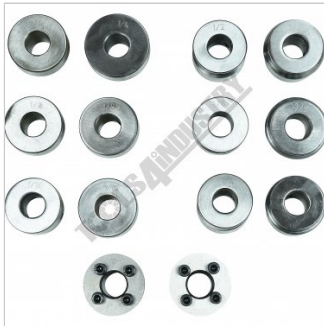
Die Sets Top View