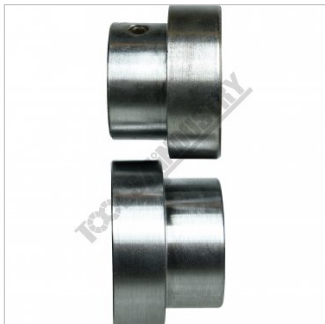
1.4 6.35mm Stepped Dies