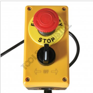
Emergency Stop-Forward-Reverse Switch