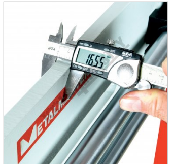
16mm Plate Steel