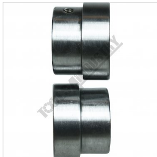
1.8 3mm Stepped Dies