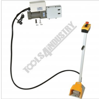
Motor Kit Assembly