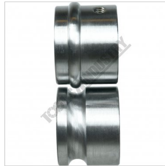
1.4 6.35mm Beading Dies