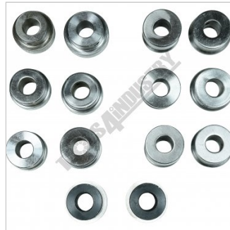
Die Sets Top View 2