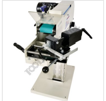
Swivel Vice From 30 90