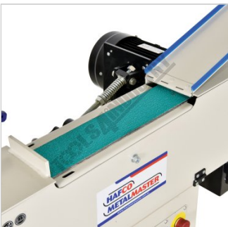
Top Station For Flat Linishing Deburring