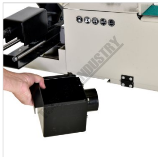
Removable Front Dust Tray