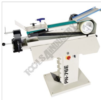
Quick Change Belt System