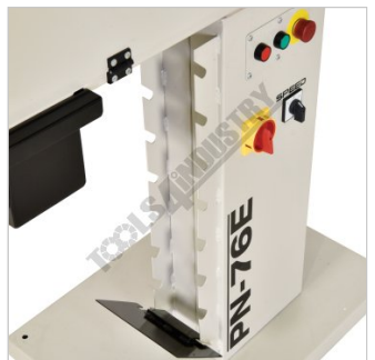
Rack For Roller Storage