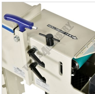
Belt Height Adjustment