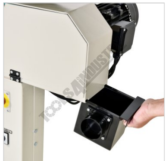
Removable Back Dust Tray