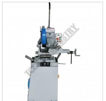
90 Degree Cutting