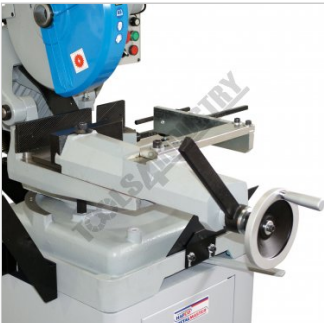
Quick Lock Vice