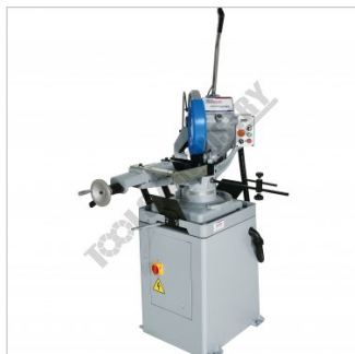
Dual Mitre Head