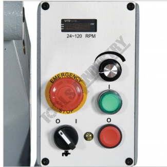
Digital Readout Control Panel