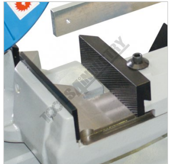
Adjustable Vice Jaw