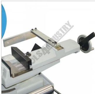
Quick Action Vice