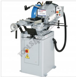
Cutting Head Down