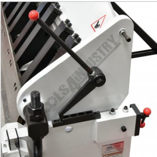
Top Beam Support Stop Lever and Thickness Adjustment Handle