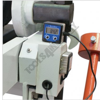
Digital Angle Readout