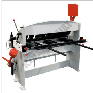
Rear Back Gauge