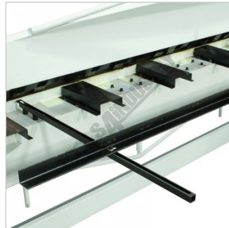
Rear Manual Backgauge