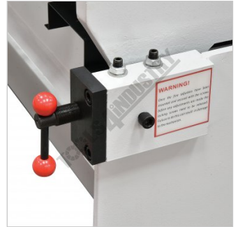
Quick Head Adjustment Handle for Material Thickness