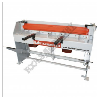
Right Top View