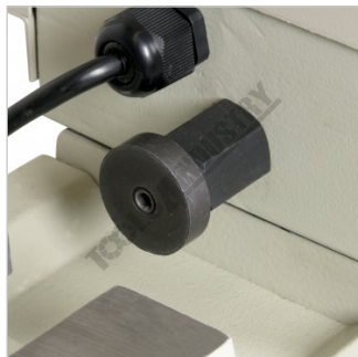
Swivel Head Release Lock