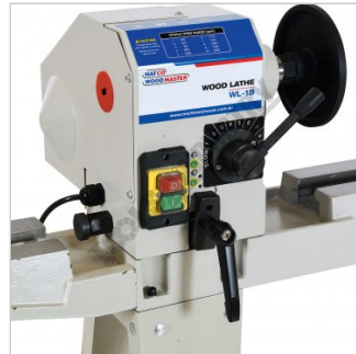
Headstock Left View