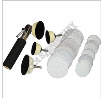
BSS 5075 Bowl Sanding Tool