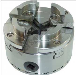
WSC 100 Scroll Chuck