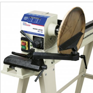
Shown Set Up with Bowl