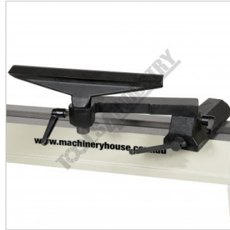
Outrigger Tool Rest