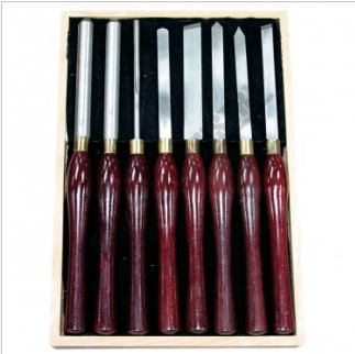
WT 8 HSS Wood Turning Tool Set