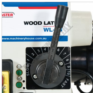
Variable Speed Lever