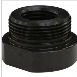
SCI 10 Scroll Chuck Insert