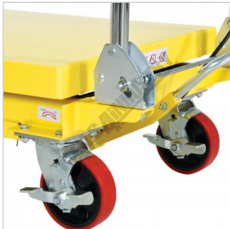
2 Swivel Brake Wheels