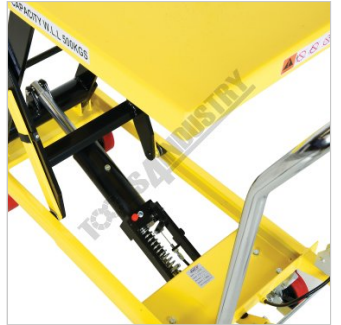
Hydraulic Lifter Ram