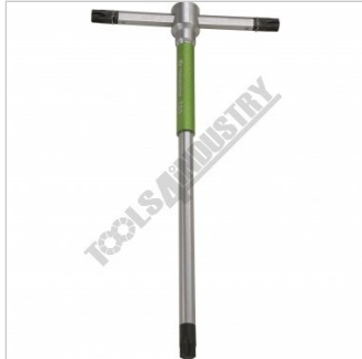
T Handle Slides with Indent Points 2