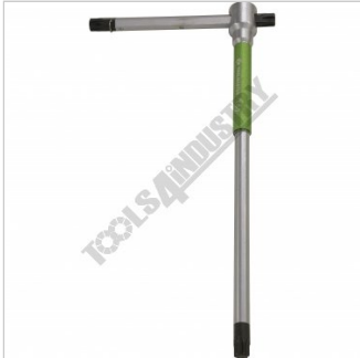
T Handle Slides with Indent Points 1