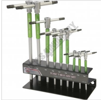
Set Right View