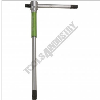
T Handle Slides with Indent Points 3