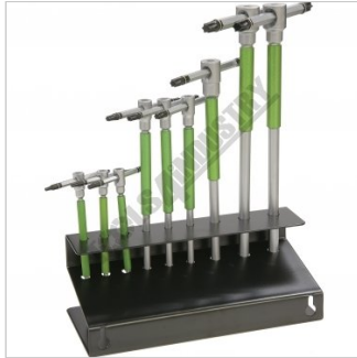
Set Rear View