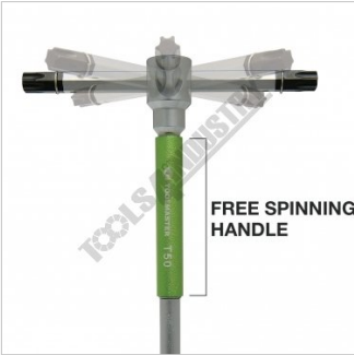
Free Spinning Handle