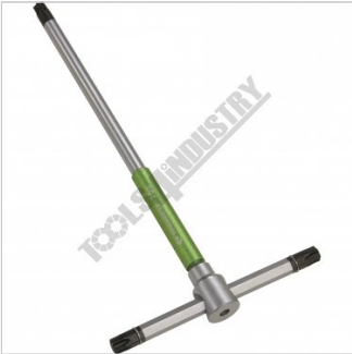
Top Right View