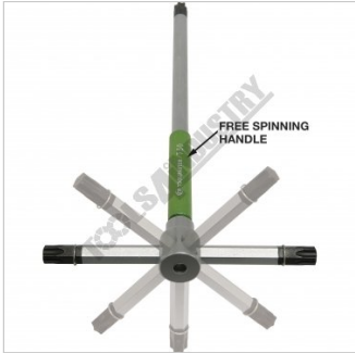
Free Spinning Handle Front View