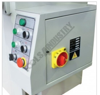
Electrical Box with Stop Switch