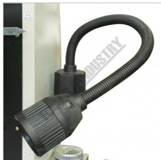
Halogen Work Light