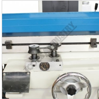
Table Feed Stop System