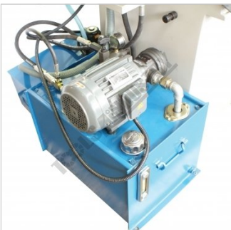
Hydraulic Unit & Coolant Tank