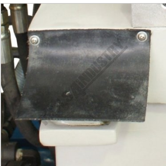
Cross Slide Covers