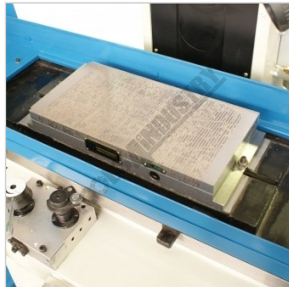
Magnetic Chuck 200 x 400mm