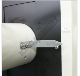
Upper Limit Guide