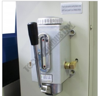
One Shot Oil Lubrication