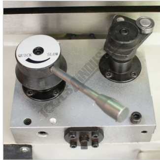
Hydraulic Feed Control