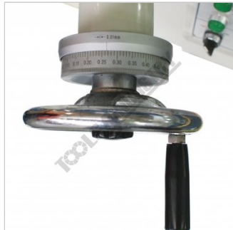
Vertical dial 0.01mm graduations