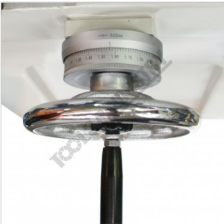
Cross travel Handle 0.02mm graduations