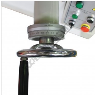
Vertical Travel Dial 0.01mm Graduations