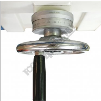
Cross Travel Handle 0.02mm Graduations