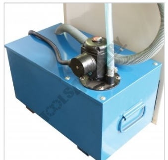
Coolant Pump & Tank