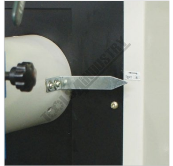
Height Upper Limit Guide