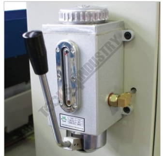
One Shot Oil Lubrication