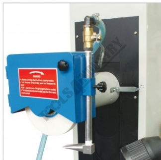
Wheel Coolant Nozzel