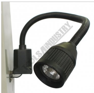
Flexible Halogen Work Light