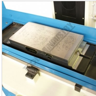
Magnetic Chuck 400 x 200mm