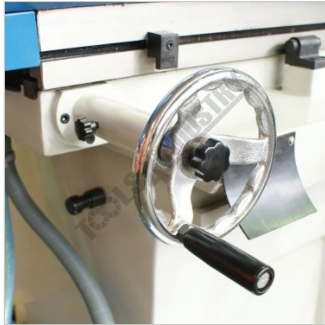
Manual Table Feed Hand Wheel