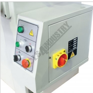
Electrical Cabinet with Stop Switch