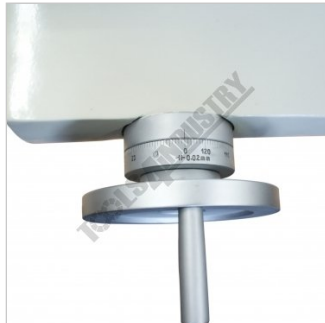
Cross Feed Dial