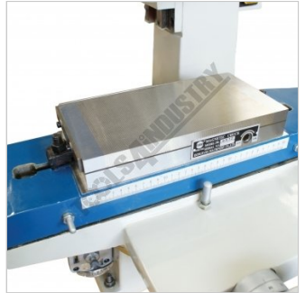
Fine Pole Magnetic Chuck