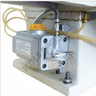
One Shot Lubrication Pump