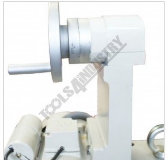
Vertical Feed Dial