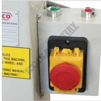
Start & Stop with Emergency Stop