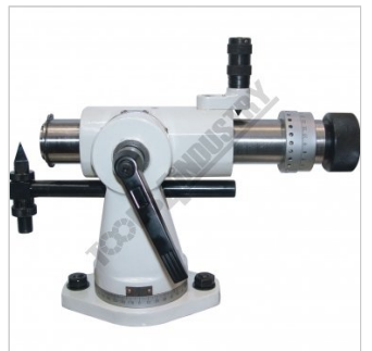
End Mill Attachment