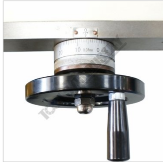
Cross Feed Handle