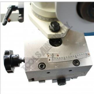
Table Angle Adjustment