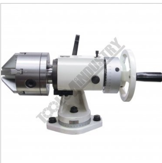
Drill Grinding Attachment