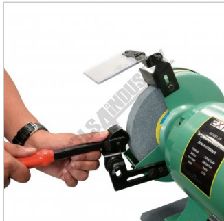
Setup for Dressing a Grinding Wheel