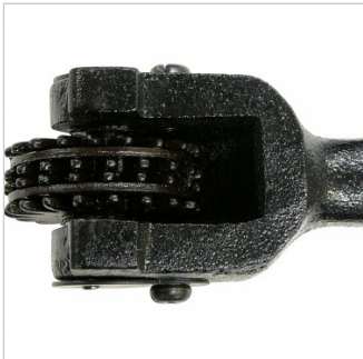
Head Bottom View