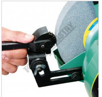
Setup for Dressing a Grinding Wheel Close Up