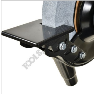
Tool Rest Dust Chute