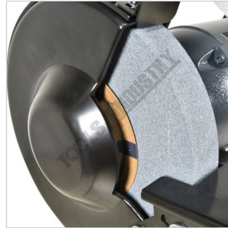
Fine Grinding Wheel