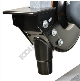
Dust Chute Adjustable Tool Rest