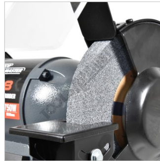
Coarse Grinding Wheel