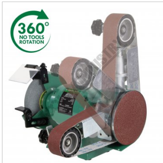
360° Rotating Linisher Attachment