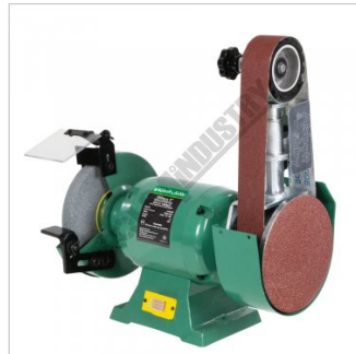
Linisher Shown Vertical