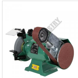
Linisher Shown 45°