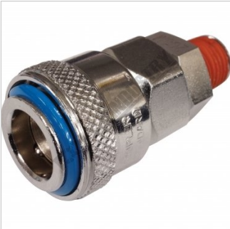
One Touch Hi Flow Coupling