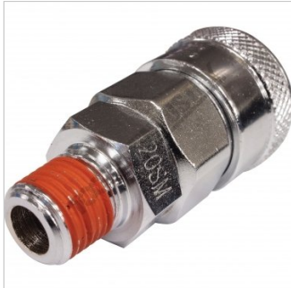
1/4" BSP Male End