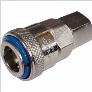
One Touch Hi Flow Coupling