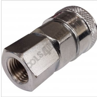
1/4" BSP Female End