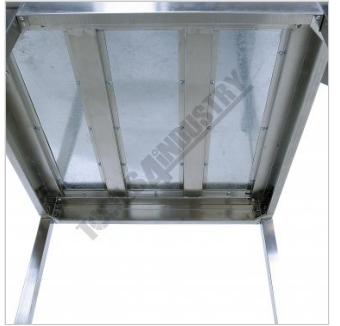
Under Table View