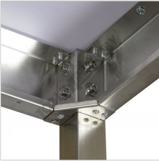
Heavy Duty Braced Legs