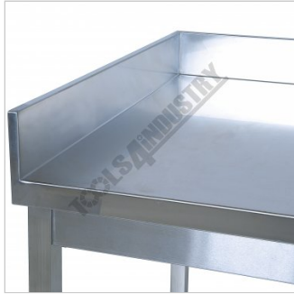
100mm Rear Splash Back