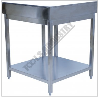
Corner Rear View