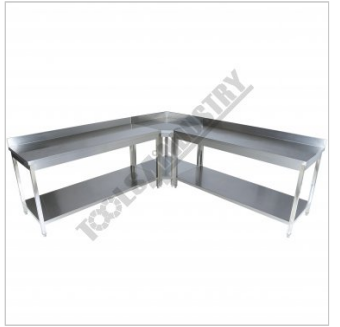
Shown with Optional SSB-18WS Work Benches