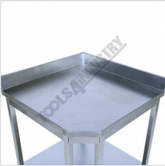
Top Bench Surface Area