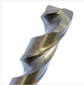
135° Split Point - M35 Grade HSS 5% Cobalt