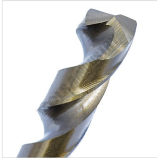
135 Degree Split Point M35 Grade HSS 5% Cobalt