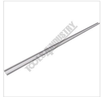
Aluminium Extrusion Length