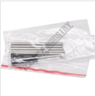
Aluminium Extrusion Joiner Pins