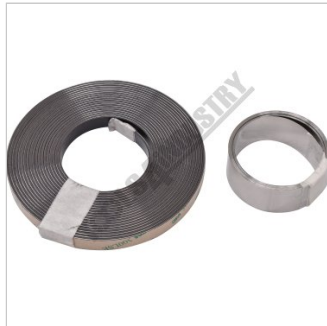
Magnetic Tape and Metal Protective Strip