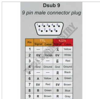
Dsub9 Wiring Diagram