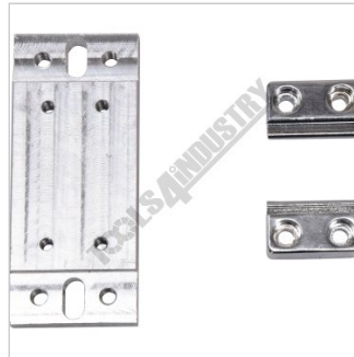
Scale Holder Bracket