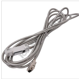
Dsub 9 and Reader Head Extension Cable