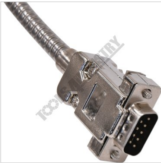
Dsub 9 Male Plug