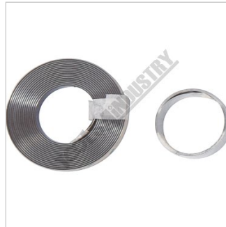
Magnetic Tape and Metal Protective Strip