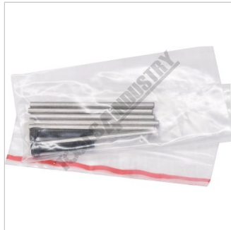
Aluminium Extrusion Joiner Pins