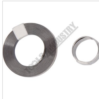
Magnetic Tape and Metal Protective Strip