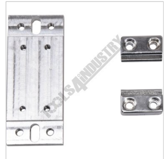
Scale Holder Bracket