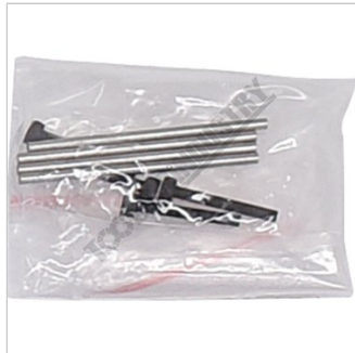
Aluminium Extrusion Joiner Pins