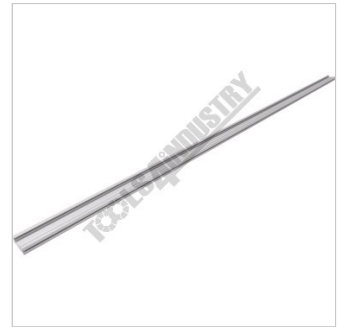
Aluminium Extrusion Length