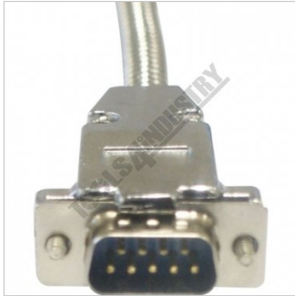
DSub9 Male Plug